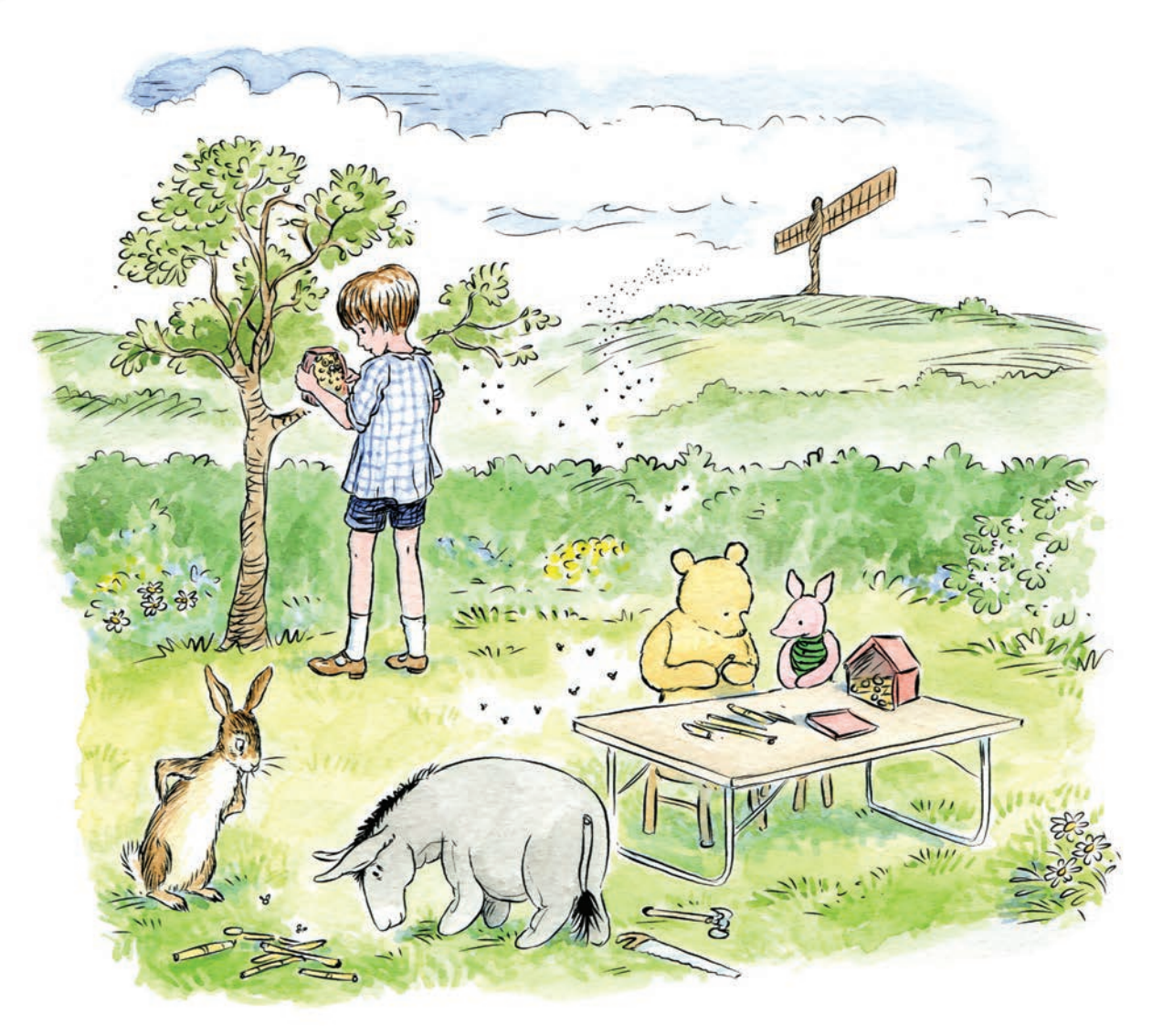
Christopher Robin, Winnie-the-Pooh and friends work together to make bee 'houses' so that the honey bees in Gateshead can have a little rest.

You can put together your own bee house and hang it on a tree or an outside wall as a shelter for solitary bees, similar to a birdhouse.