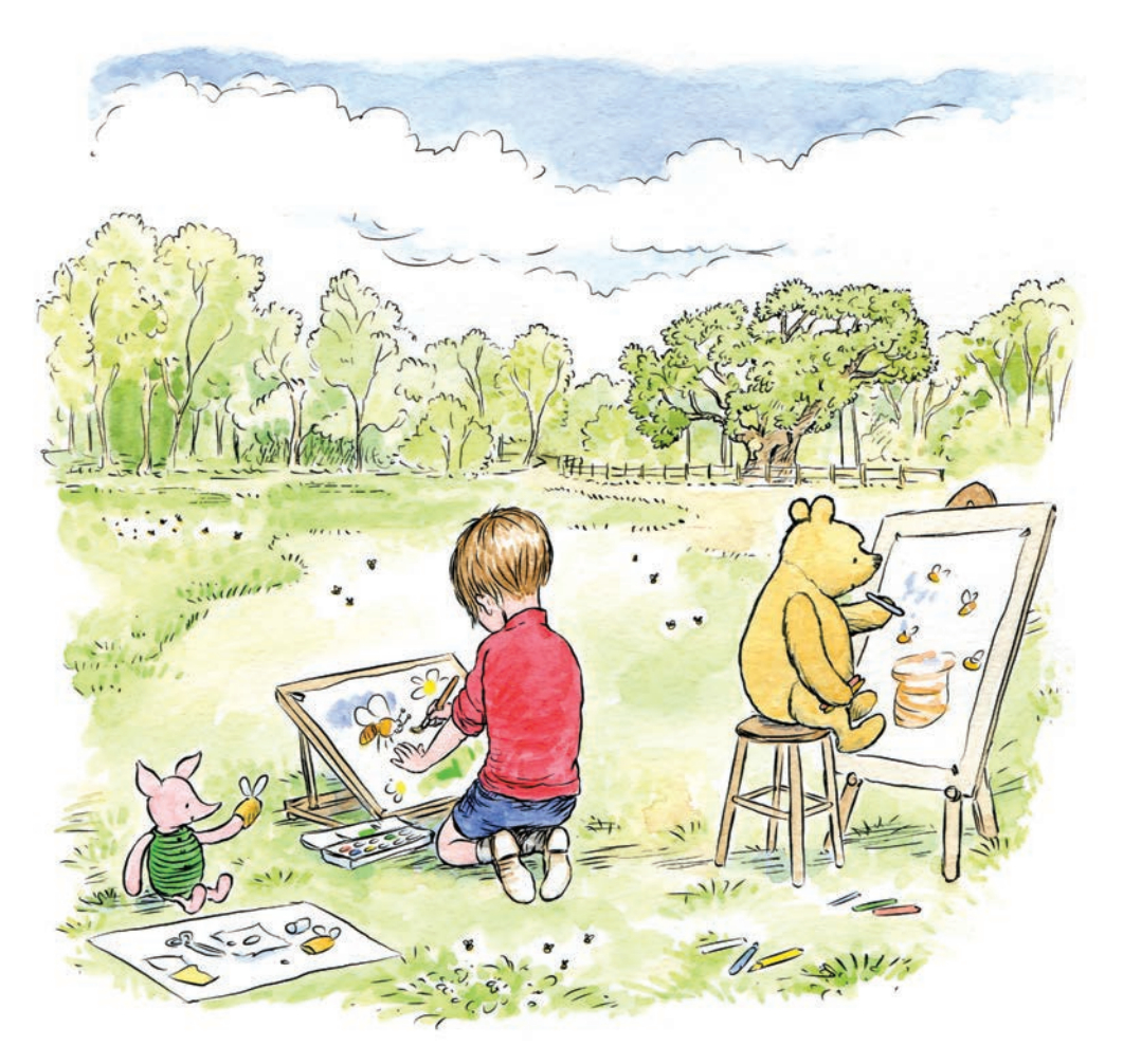
On a summer's day in Sherwood Forest, Winnie-the-Pooh, Christopher Robin and Piglet have fun creating paintings and finger puppets inspired by honey bees.

Sparking children's interest in helping the honey bees will ensure that we continue to look after our honey bee population for many years to come. Some simple craft ideas include creating bee finger puppets to tell the story of pollination, painting bee pictures, making model honey bees from egg boxes or even knitting bee toys. For more arts and craft ideas, visit the BBKA's Children's Corner: www.bbka.org.uk/kids/more_childrens_corner.