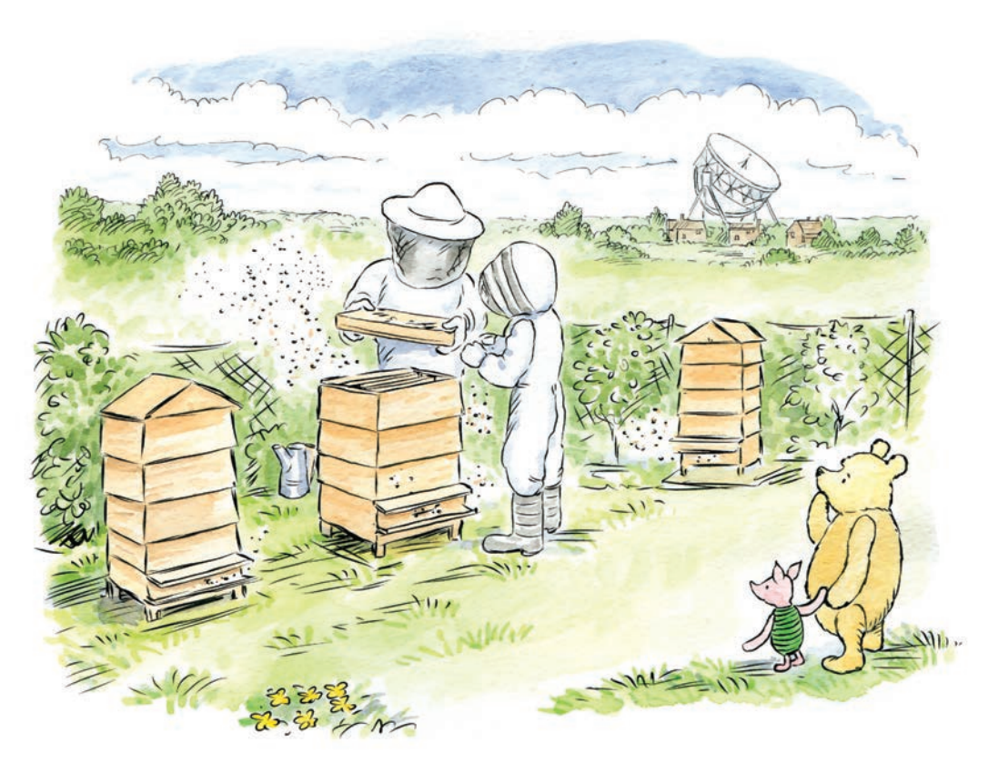
Winnie-the-Pooh and Piglet watch in fascination as Christopher Robin learns about honey bees from a local beekeeper in Cheshire.

For more information about upcoming courses, visit: www.bbka.org.uk/news_and_events/events.php. Or contact your local beekeeping association for details about courses in your areas: www.bbka.org.uk/about/local_associations/find_an_association.php.