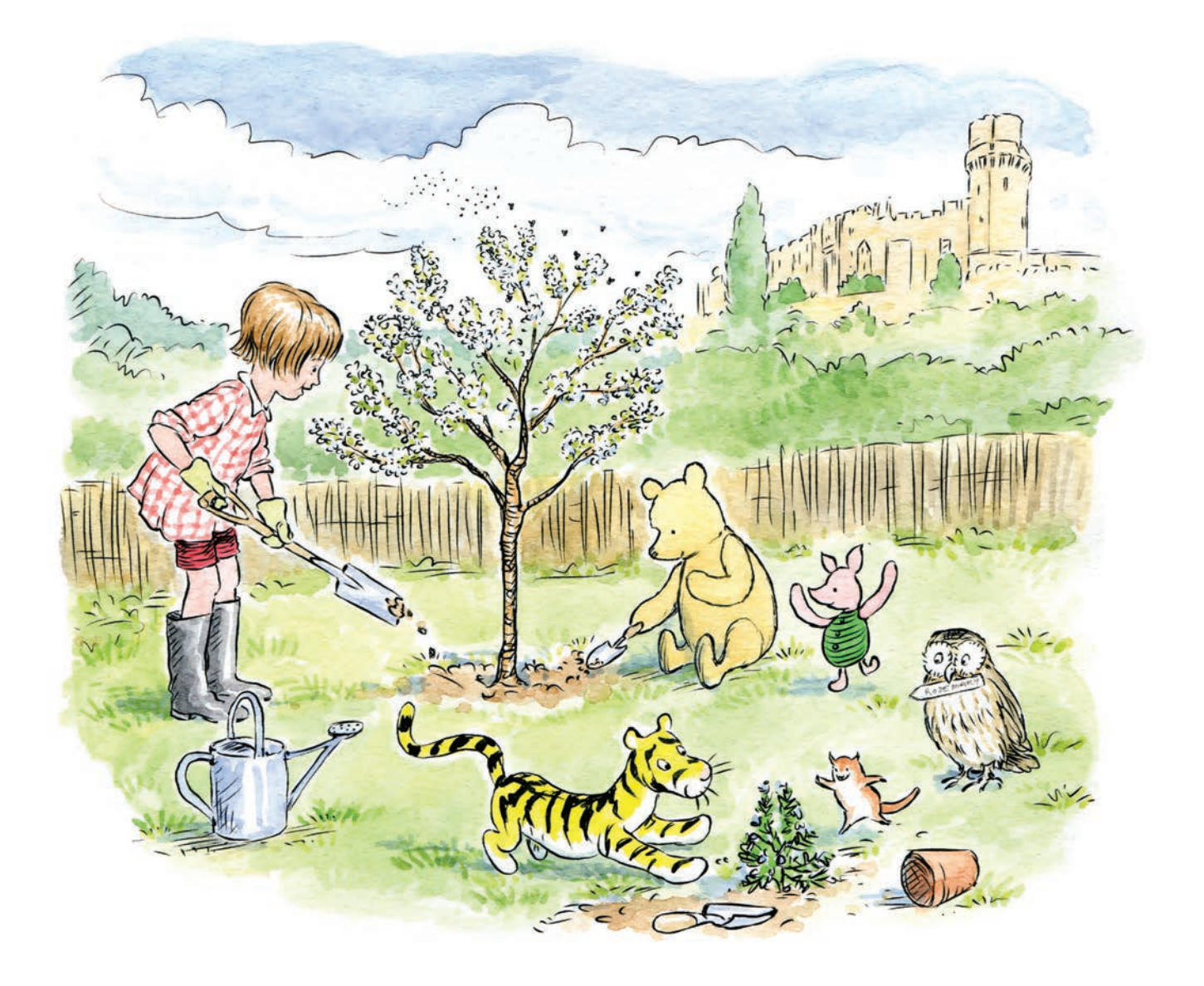
Created by the British Beekeepers Association and Egmont Publishing