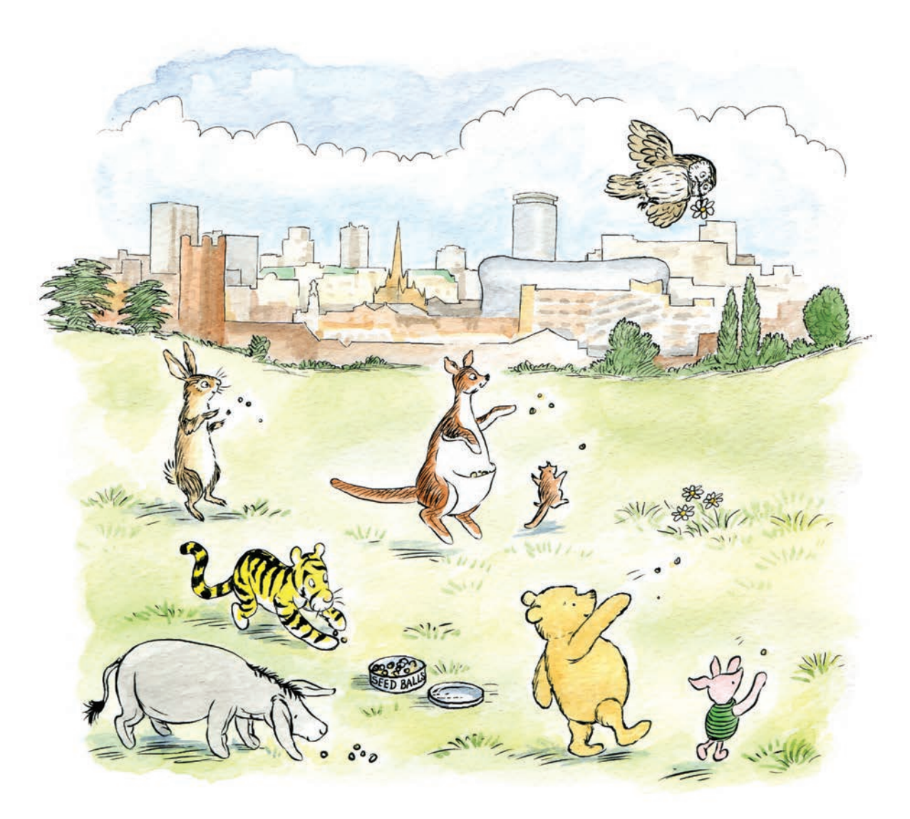
Winnie-the-Pooh and friends help to create wild flowers for honey bees by dropping seed balls in Birmingham.

These small balls are made up of soil, clay and seeds, and work by protecting new seeds from the heat of the sun, strong wind, heavy rain and animals that would eat them. This gives the new seeds the best chance of growing. Seed balls should be gently thrown one at a time over the area to be planted, and don't need to be buried or watered. You can purchase seed balls online or at a local gardening retailer.