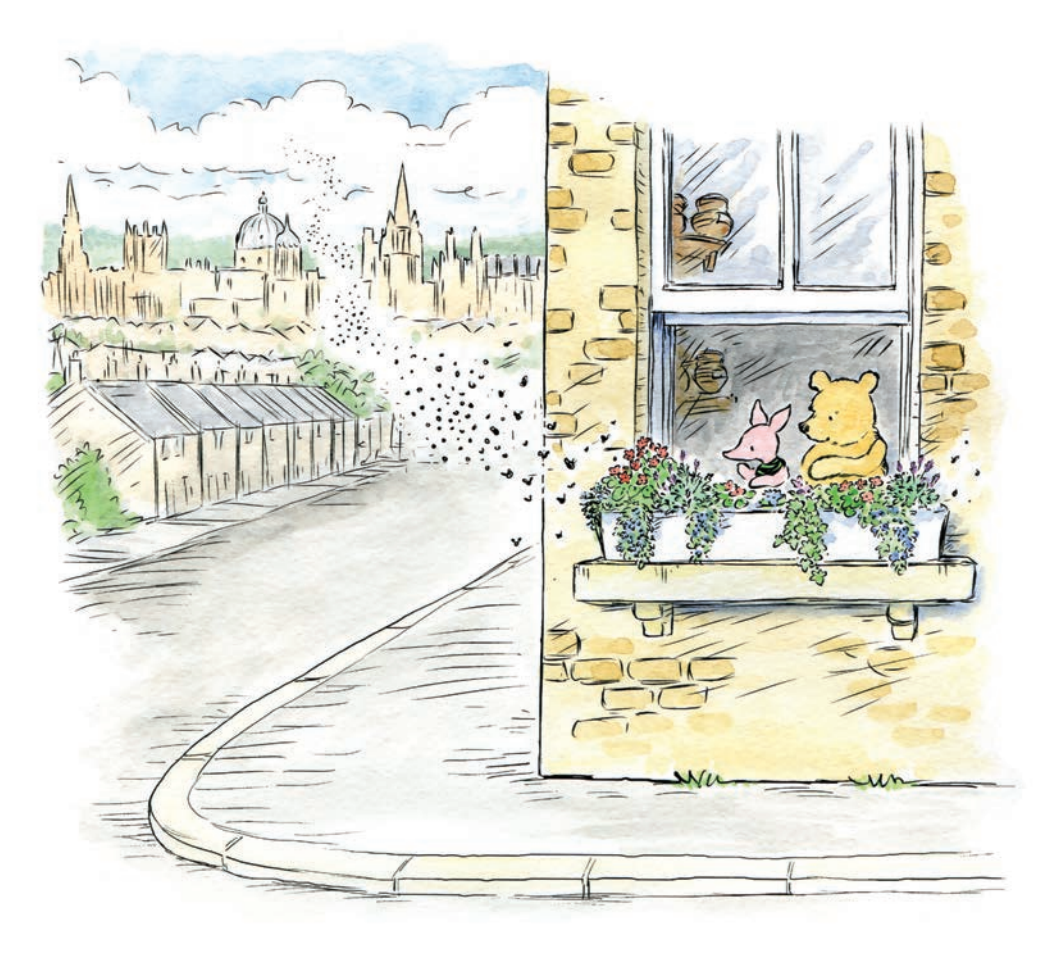
Winnie-the-Pooh and Piglet plant a pretty flowering window box in Oxford to help provide food for the honey bees.

For more info about the plants and flowers to grow for honey bees and when to plant them, visit: www.bbka.org.uk/learn/gardening_for_bees.